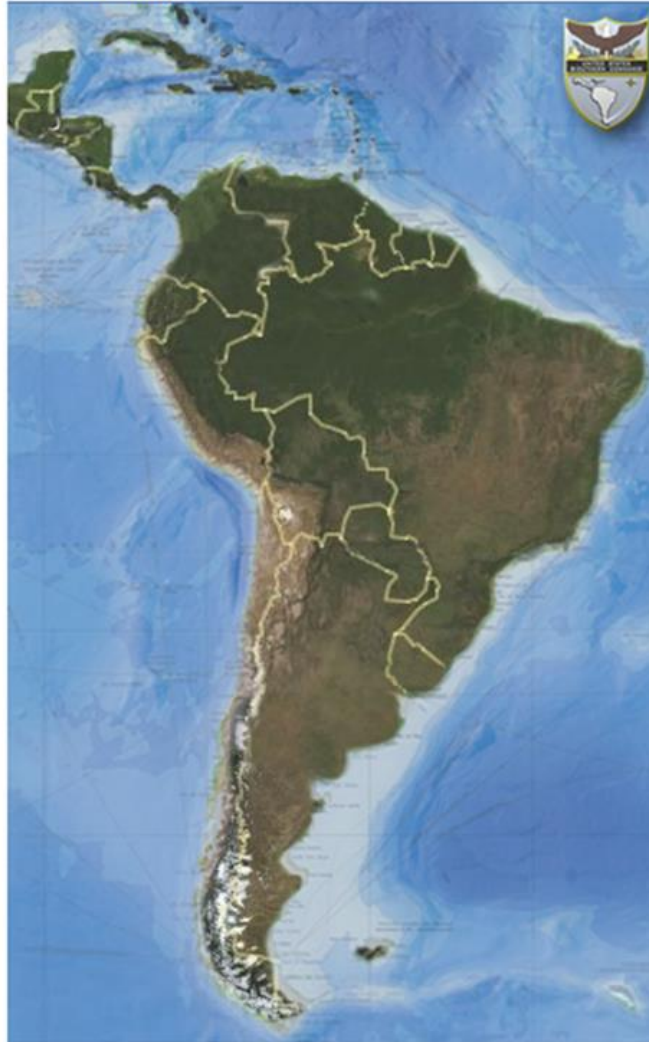
Area of Focus